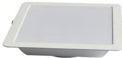
Model SD1508: 30W