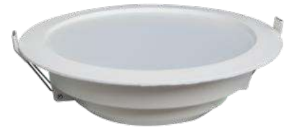
Model SD1507: 25W, 30W