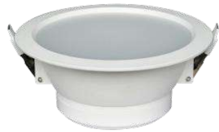
Model SD1506: 8W, 12W, 15W, 20W, 25W